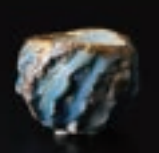
Toru Ichikawa / Okinawa