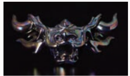
Taking into account historical and cultural contexts, Koga's work reveals his respect for classical art. Requests to commission original works are possible.