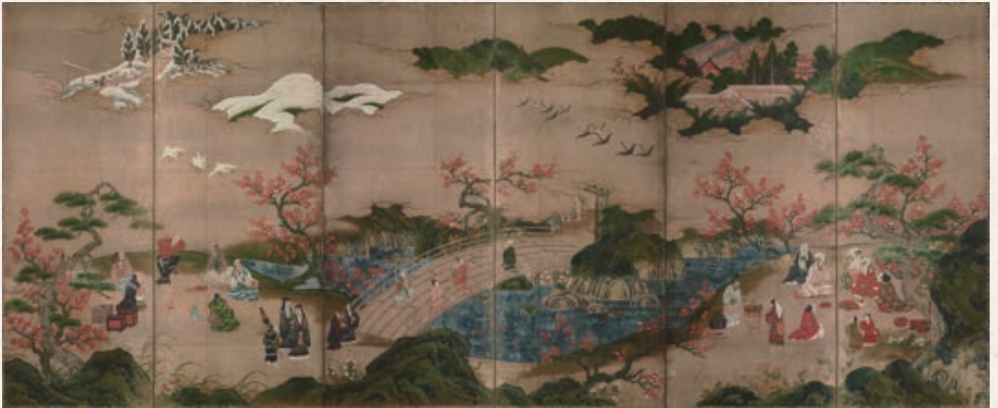
Japan's National Treasure, 'Maple Viewers' folding screen

At INFINITY we have unique connections within the art world, including museums and world-class artists. The National Treasure 'Maple Viewing' folding screen is owned by the Tokyo National Museum. INFINITY can arrange special private viewings of Kanō Hideyori's treasured work which recreates the custom of enjoying autumn leaves in Japan. Afterwards, guests are invited to dine under autumn leaves in a museum garden which recreates the screen painting from the Muromachi - Azuchi-Momoyama period. After dining, guests are welcome to enjoy a traditional Japanese Noh play 'Momijigari.'