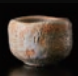
Ryoutaro Kato / Gifu