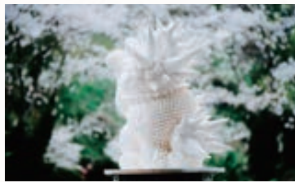
Koga pursues an 'anti Wabi-sabi' theme in order to give his art a daring, bold presence, despite the artist himself having respect for Sen no Rikyū.