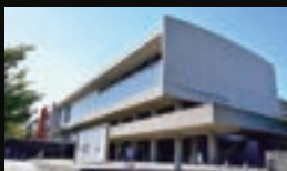
The National Museum of Modern Art, Tokyo