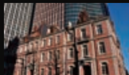
Mitsubishi Ichigokan Museum