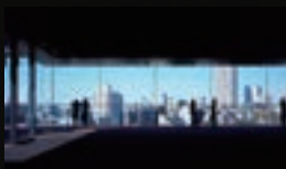
Suntory Museum of Art