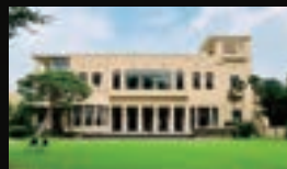
Tokyo Metropolitan Teien Art Museum